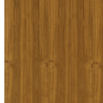
Rare Teak #3