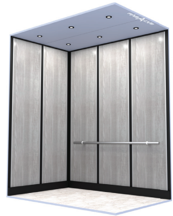
CAPACITY 4500LBS - 5000 LBS