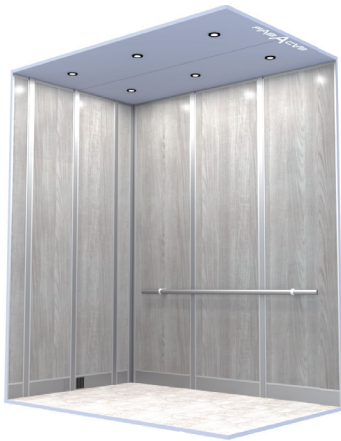
CAPACITY 2100LBS - 3000 LBS