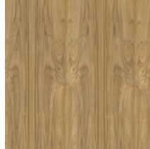
Rare Teak #2