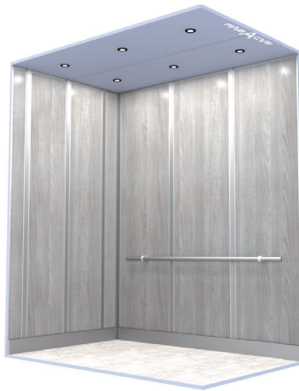
CAPACITY 3500LBS - 4000 LBS